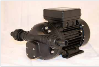
220 volt 35L/min AD blue pump