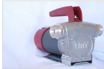
FMT 35L/min pump (available in 12 or 24 volt)