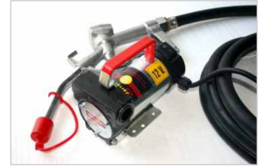
Jerrycar 40L/min battery kit (available in 12 or 24 volt) includes: