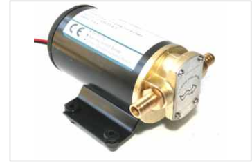
Viscomat 12 volt 14L/min gear pump