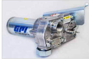
GPI M-150S- 57L/min explosion-proof pump (available in 12 or 24 volt). 150S-AV. Specially designed for ground refuelling of aircraft.