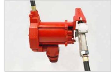
FILLRITE 57L/min explosion-proof pump (available in 220, 12 or 24 volt)