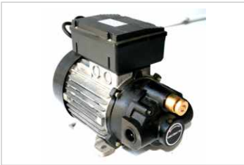
Viscomat 220 volt 25L/min vane pump