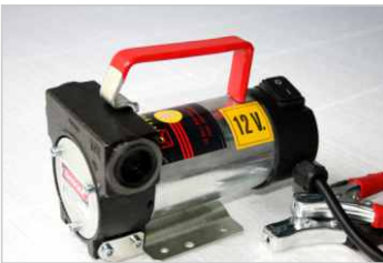
Jerrycar 40L/min pump (available in 12 or 24 volt)