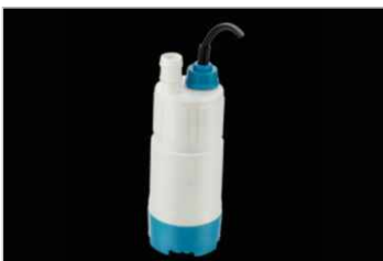
Submersible 12 volt diesel/water pump 18L/min Max head: 10m