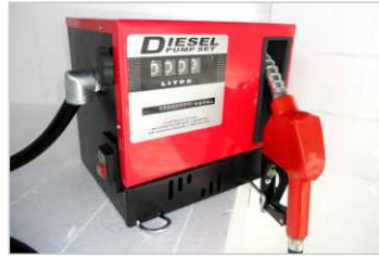
Jerrycar 220 volt cube box pump set 60L/min includes: