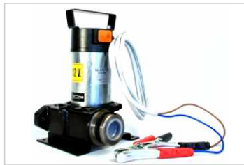
NALA 40L/min pump (available in 12 or 24 volt)