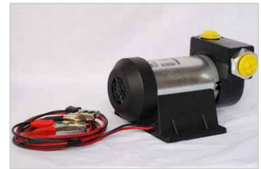
Gespassa 45L/min pump (available in 12 or 24 volt)