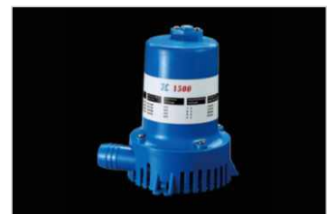
Marine submersible water pump 12 volt 5 500 litre per hour max Max head: 5m