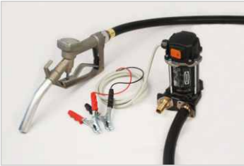
Piusi 48L/min pump (available in 12 or 24 volt)