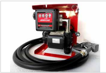
Jerrycar 220 volt pump set 60L/min includes: