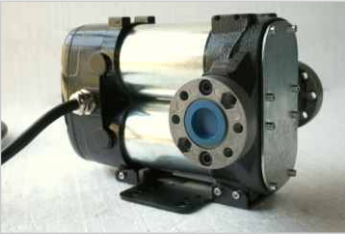
Piusi Bi pump 80L/min available in 12 or 24 volt