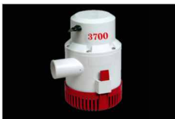
Marine submersible water pump 12 volt 10 000 litre per hour max Max head: 5m