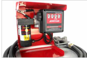
Jerrycar 12 volt pump set includes: