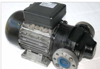
Jerrycar 220 volt diesel pumps available in 60L/min; 80L/min and 100L/min