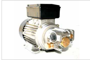
Viscomat 220 volt 9L/min gear pump