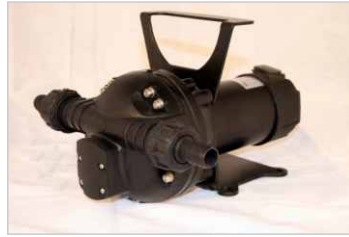
12 volt 35L/min AD blue pump