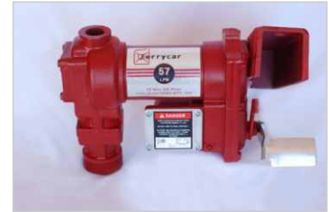
Jerrycar 57L/min explosion-proof pump (available in 12 or 24 volt)