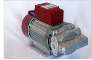
FMT 220 volt 100L/min pump