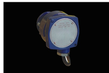
J.S. -100 encoder