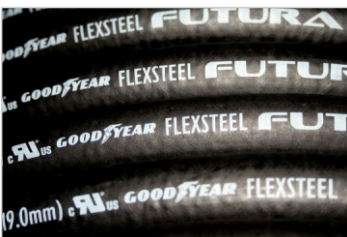
Goodyear Futura Flexsteel petroleum transfer hose 1", 3/4" and "

With cover resists cracking and fading, designed to dispense a wide range of fuels with extreme durability. The wire braid construction provides excellent kink resistance, low computer creep, and long service life. UL 330 and CUL approved.