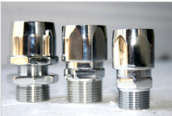
Hose connectors 3/4" and 1" with BSP and BSPT thread