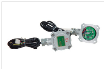
M.D. -212 encoder (ATEX)