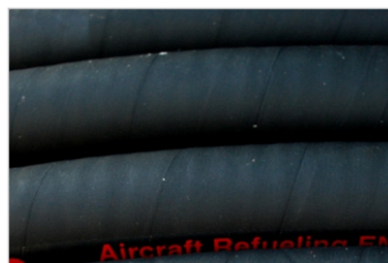
Aircraft refuelling hose (Wingcraft) and/or (Jetranger)

For fuelling or defuelling commercial and private aircraft. It handles Jet A-1, Jet A and higher aromatic aviation gasoline. Its high working pressure permits use in fuel cart hydrant service. Hose meets API bulletin 1529-6 th edition, 2005 and N.F.P.A. bulletin #407 (2007 revision).