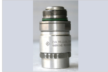
Dry break couplers for ZVA nozzles (reusable)