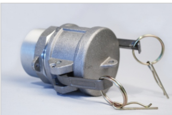
A wide range of aluminium couplers