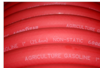
Aggie gas (farm tank hose) agriculture gasoline hose 1"

For fuelling or defuelling commercial and private aircraft. It handles Jet A-1, Jet A and higher aromatic aviation gasoline. Its high working pressure permits use in fuel cart hydrant service. Hose meets API bulletin 1529-6 th edition, 2005 and N.F.P.A. bulletin #407 (2007 revision).