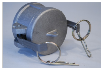
A wide range of aluminium couplers