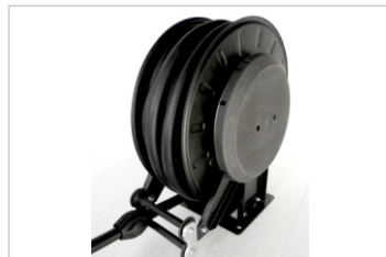
Automatic hose reels: