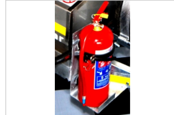
Fire extinguisher and wall bracket (9kg)