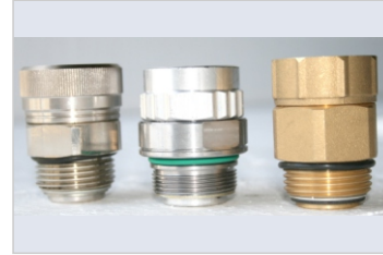
Hose swivels 3/4", 1", 1 1/4", 1 1/2" and 2"