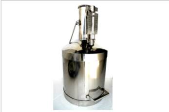
Stainless steel calibrating can (prover) 20L