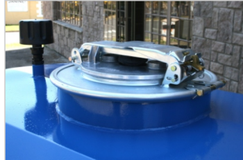
Petroleum manhole cover and collar