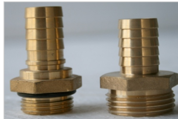
Brass swage nipples with BSP thread available in the following sizes: