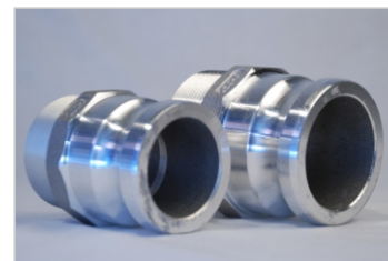
A wide range of aluminium couplers